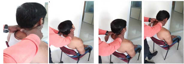
Fig. 2: SNAGs for cervical side bending.