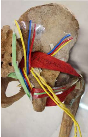
Fig. 1: The structures under the cover of gluteus maximus.

Usually at the end of each region, an examination was taken by the students on that region and an anonymous feedback was obtained from the students regarding their perceptions about the various aspects of model making as a method to learn Anatomy through a self-administered questionnaire after the exam. The questionnaire ( Table 2 ) had six items, each item being scored on a five-point Likert rating scale. The items were developed based on previous literature and were all positively framed [6, 9,14,15]. Pilot testing of the questionnaire was done on the first group of students. The reliability of the questionnaire was found to be satisfactory (Cronbach's alpha of 0.70). The proportion of students who responded in each category for each item was tabulated.