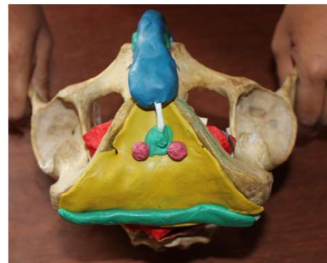
Fig. 5: Deep perineal pouch.

The figure shows superficial muscles of male perineum (pink colour), perineal body (green colour), colles fascia (full yellow triangle), Perineal membrane (two yellow triangles) and penis (blue colour) on the inferior surface of base of bony pelvis