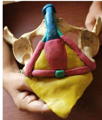
Fig. 4: Superficial perineal pouch.

The figure shows Parotid gland plaster of paris model with its borders and surfaces and the structures emerging at the periphery of the gland