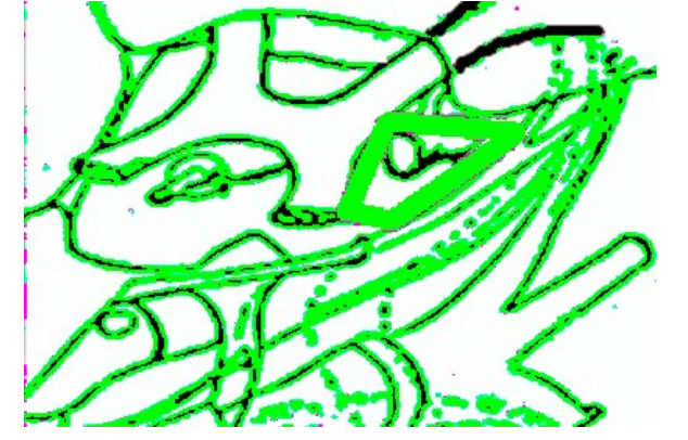
Fig. 3: Medial triangle.