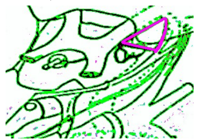
Fig. 2: Anterolateral medial triangle.