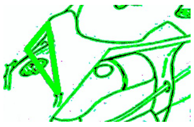
Fig. 10: Medial inferomedial triangle.