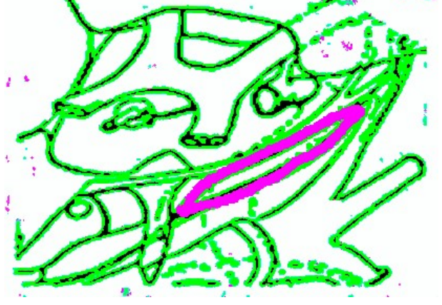
Fig. 4: Superior or paramedian triangle.