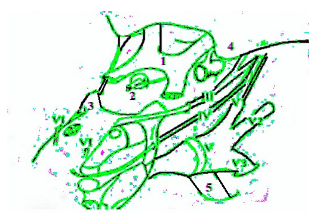
Fig. 1: CS and the position of the cranial nerves. 1-Optic chiasm 2- Pituitary stalk 3- Left posterior clinoid process 4-Right anterior clinoid process 5- Right internal carotid artery.