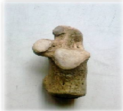
Fig. 3: Type II- 2 facets with distinct groove separating anterior & medial facet.