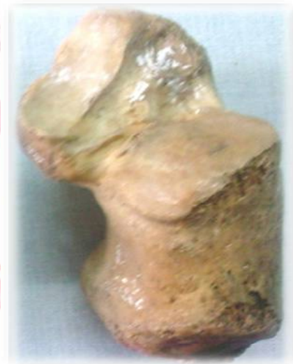
Fig. 2: Type Ib- transitional figure 8 forms with fused anterior and medial facet.