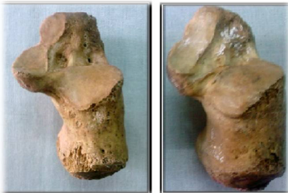
Fig. 7: Showing normal calcaneum (Rt. Side) and calcaneum with subchondral sclerosis at sustentaculum tali (Lt. side).