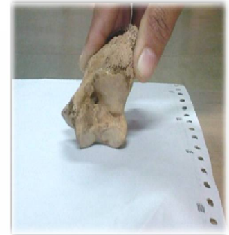
Fig. 5: Measurement of angle of intersection of sustentacular tali facet.