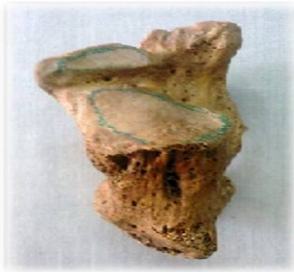
Fig. 4: Type III- sustentacular tali with medial facet only & no anterior facet.