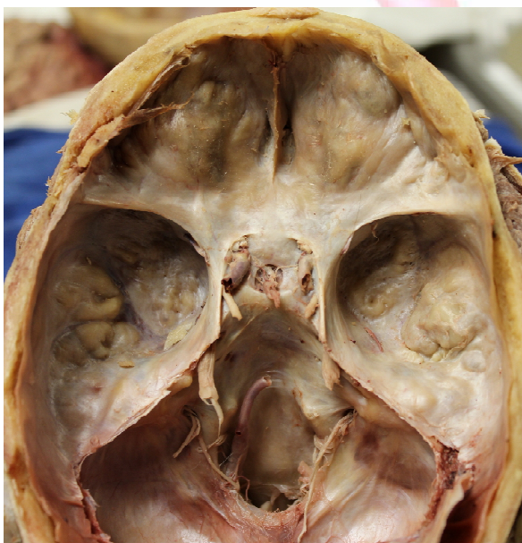
Fig. 2: Inferior view of anterior skull cap. The hyperostotic growths continued along the frontal bones, bilaterally. The midline was spared.

Fig. 1: Superior view. Hyperostotic growths were observed bilaterally in the sphenoid and temporal bones as smooth, ossified ridges and nodules protruding from the internal table of the cranium.