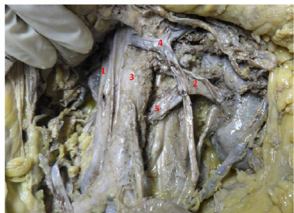
Fig. 3: Circum Aortic Left Renal Vein—Type 3.