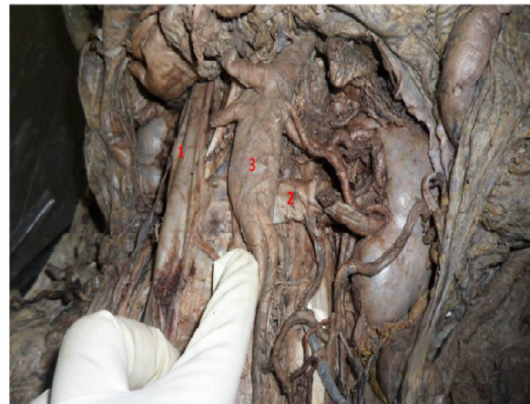
Fig. 1: Retro Aortic Left Renal Vein—Type 1.

circum aortic left renal vein (Fig.3). The incidence of Left Renal Vein Anomalies in the present study was represented in table 1.