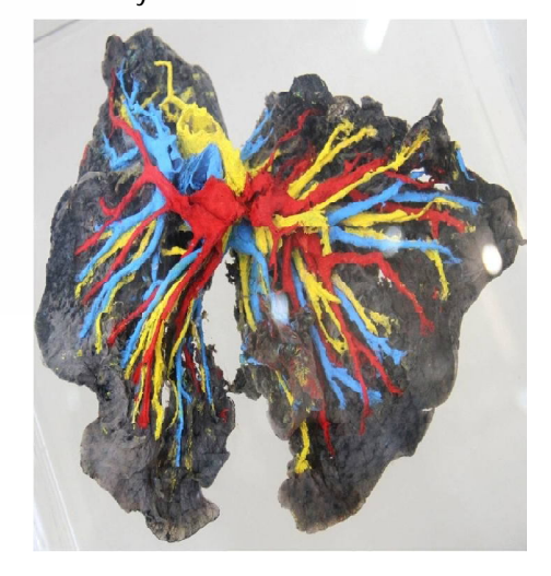
Fig. 3: Showed no separate bronchus, pulmonary artery and pulmonary vein for Accessory lobe. Lower lobe bronchus, pulmonary artery and pulmonary vein were found in the Accessory lobe.