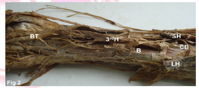
Fig. 2: Photograph of left arm showing the presence of the 3<sup>rd</sup> head of biceps brachii (lateral view).

The 3<sup>rd</sup> head of biceps brachii(3<sup>rd</sup> H) originates from the anteromedial aspect of humerus in between the attachments of coracobrachialis(CB) and brachialis(B) and inserts into the common bicipital tendon (BT) formed by short(SH) and long (LH) heads of biceps brachii.