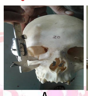
Fig. 2: Vertical and Transverse Measurements.

The maximum distance on the right side was 21 mm and minimum was 11mm. The maximum distance between the IOF and pyriform aperture was 31mm and minimum was 19mm on the left side while on the right side the maximum distance was 30 mm and minimum distance was 19mm. The mean of the transeverse distance was 26.2 mm on the left side and 25.8 mm on the right side. Accessory foraminae were present in three skulls of which it was unilateral in two skulls and bilateral in one skull as shown in fig. 1 and 2.