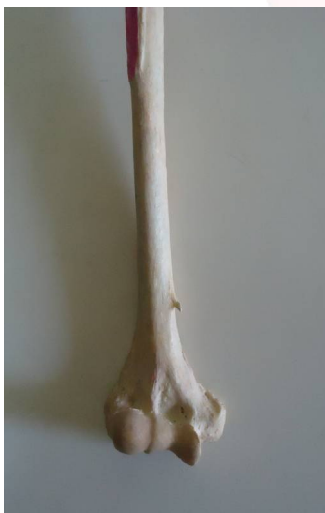
Fig. 1: Photograph showing right humerus with Supracondylar process.

Out of 280 dried humeri examined, we found only 1 humerus of the right side with an osseous spine on the anteromedial surface (Fig. 1). It was 5.5.cms proximal to medial epicondyle (ME) was projecting 0.7 cms from the surface and 1.1 cm long vertically and 0.9 cms broad. The spine was directed oblique, forward and downwards