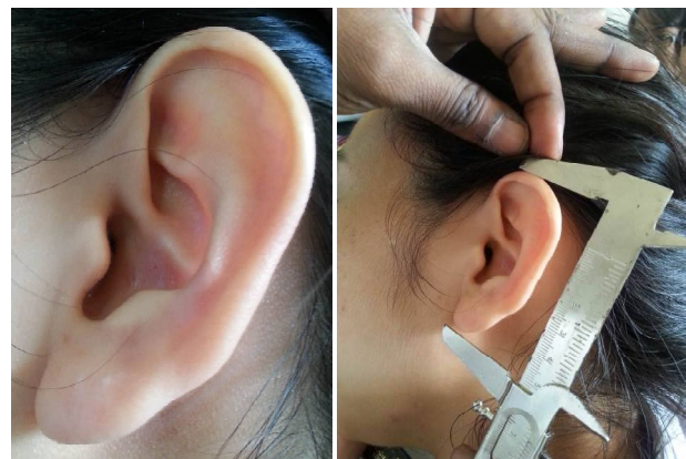
Fig. 1: Pictures showing ear landmarks and dimensions.

AB = Total ear length (Physiognomic ear length); CD = Ear width (Physiognomic ear width); AE = Length of cartilaginous ear; EB = Ear lobe length.