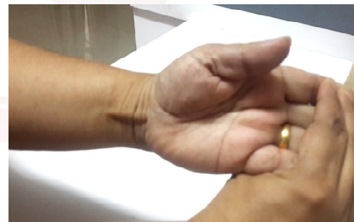
Fig. 3: Mishra's Test I.

Mishra's Test II: The subjects were asked to abduct the thumb against resistance with the wrist in slight palmar flexion (Fig. 4).