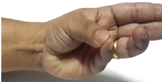
Fig. 1: Schaeffer's test for Palmaris longus.

In case, the tendon was not visible or palpable with the above standard tests, other tests such as Thompson's test [19], Mishra's test I [20], Mishra's test II [20] and Pushpakumar's test were also done before agenesis of the muscle was concluded.