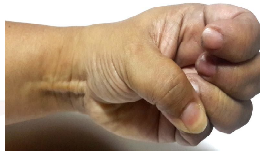
Fig. 2: Thompson's Test.

Mishra's Test I: The subjects were asked to flex the wrist, while the examiner passively hyper-extended the metacarpo-phalangeal joints of all the fingers 20 (Fig.3).