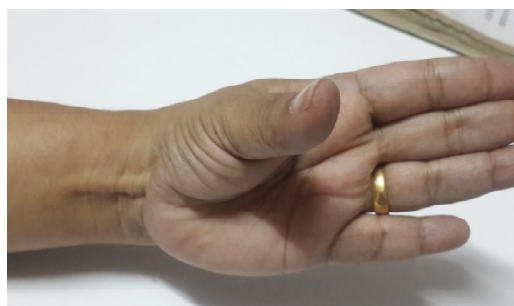
Fig. 4: Mishra's Test.

Pushpakumar's Test [22]: This is a two finger test where the subject is asked to fully extent the index and middle finger, keeping the wrist and all the other fingers flexed. The thumb is kept fully opposed and flexed.