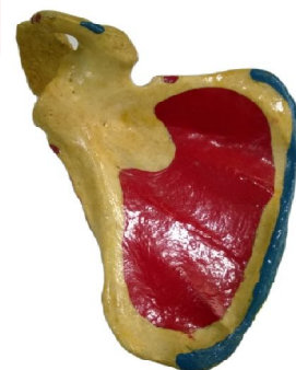
c. U shaped