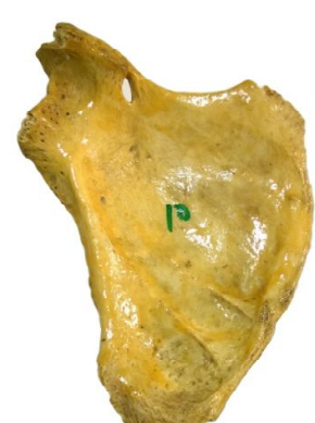
f. Complete ossification