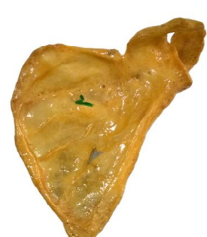
d. V shaped