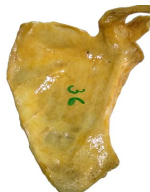
e. J shaped