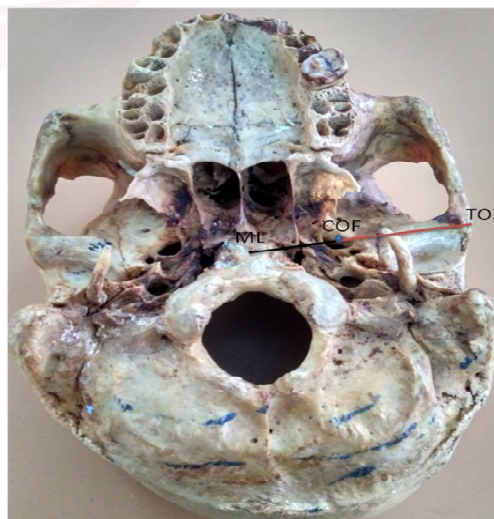
Fig. 1: Distance from the centre of the foramen ovale (COF) to the tubercle of root of zygoma (TOZ) and distance from the COF to the midline (ML) of the base of the skull.

Present study was carried out on 100 foramina ovalia using 50 dry adult human skulls of South Indian origin. Skulls with damage at the surroundings of foramen ovale were excluded from the study. All the skulls were observed to note the presence of any accessory bony structure like bony plate, spine, tubercle and septa. The size of the FO was measured by taking Antero-posterior length and the width. The location was determined by measuring following parameters. Distance from the centre of the foramen ovale (COF) to the tubercle of root of zygoma and distance from the COF to the midline of the base of the skull was also measured bilaterally using double tipped compass and digital vernier calipers (Figure 1).