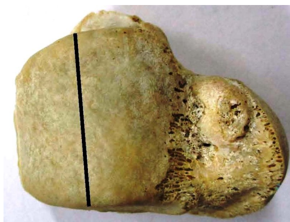
Fig. 2: Showing the measurement of breadth of trochlea of talus.

Height of trochlea of talus/ trochlear height of talus: Height of trochlea of talus was measured as the distance between the highest and the furthestmost point of the mid-sagittal