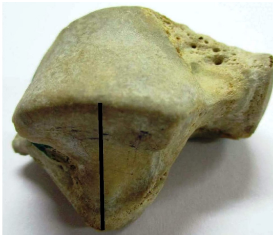
Fig. 3: Showing the measurement of height of trochlea of talus.

To avoid intra-observer variation, each measurement was taken at three different times and the mean of all three readings was taken as the final reading.