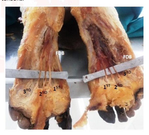
Fig. 2: Unilateral (right side) absent of 4<sup>th</sup> tendon of (FDB) flexor digitorum brevis muscle showing only 1<sup>st</sup>, 2<sup>nd</sup>, 3<sup>rd</sup> tendons.