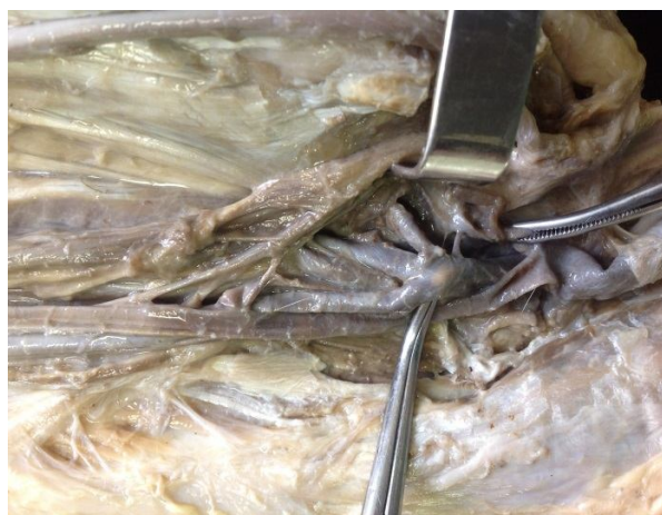
Fig. 1: Popliteal artery trifurcation.

Twenty one anatomical specimens of the Department of Morphology from Fluminense Federal University, preserved in 10% formalin aqueous solution, were used in this study. The specimens were studied by gross anatomy dissection according to the Helsinki Declaration and approved by the Scientific Council. According to the classification of Kim et al (6) , were considered the distance between medial tibial plateau and arising at first popliteal artery branch (distance A), the posterior tibial-peroneal trunk length (distance B), the distance between first popliteal branch and its bifurcation (distance C) and the anterior tibial-peroneal trunk length (distance D). For such measurements a digital caliper rule was utilized.