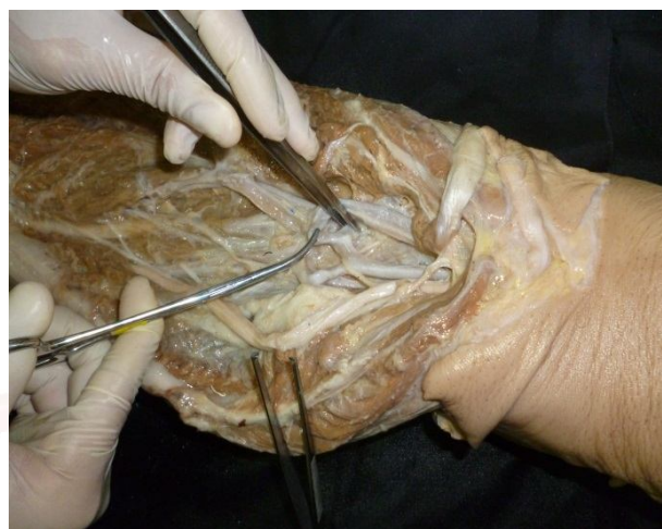
Fig. 2: Anterior tibial-peroneal trunk. Length = 1cm (distance D).

The distance A had an average of 6.2\text{cm} \pm 1.37 . The distance B averaged 2.2\text{ cm} \pm 1.4 . The distance C appears only in cases of trifurcation (IB) and should be equal to or less than 0.5cm according to the criteria of Adachi [19]. The only value of distance D found was equal to 1cm.