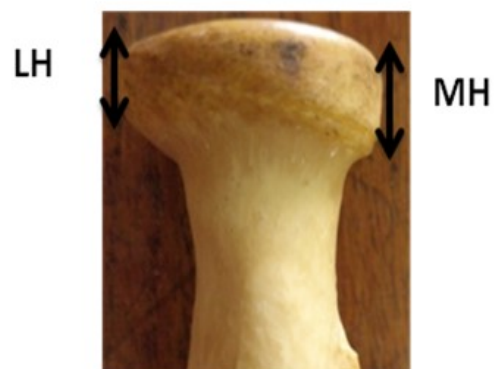
Fig. 3: Measurement of the Thickness of ventral (TVC), lateral (TLC) and dorsal (TDC) curves.