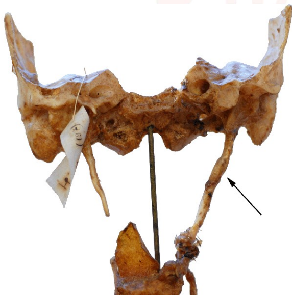
Fig. 1: Arrow pointing the elongated styloid process and calcified stylohyoid ligament.

The SP length was measured using a digital caliper and photographed. The SP was long 50 mm on the right and 70 mm on the left (fig 1). The abnormally elongated SP was due to ossification of the SL (fig1). It was attached to the skull base superiorly, just in front of the mastoid process, and inferiorly attached to the hyoid bone.