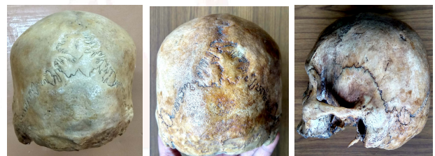
Fig. 7: Showing sutures with Irregular edges