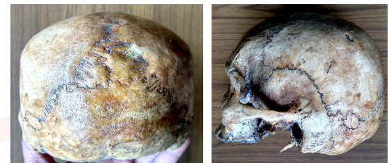
Fig. 6: Showing sutures with Serpigenous edges