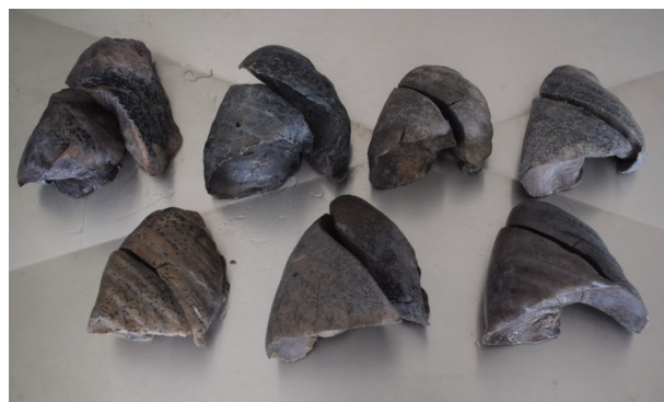
Fig. 2: A, B & C:- Showing the incomplete horizontal fissures closer to the oblique fissure on the costal surface of the right lung.