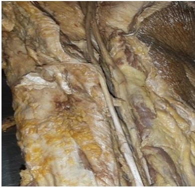
Fig. 6: Division in the middle of thigh.