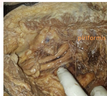
Fig. 4: Division of sciatic nerve at the lower border of gluteus maximus.