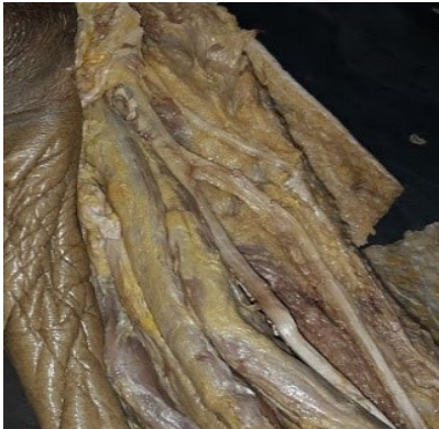
Fig. 7: Bilateral variation of division of sciatic nerve on both sides.