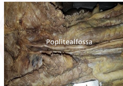
Fig. 3: Division of sciatic nerve at higher level. Both Tibial nerve and Common peroneal nerve are seen separately below piriformis.