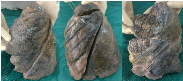
Fig. 4: Right lung showing incomplete horizontal and oblique fissure.