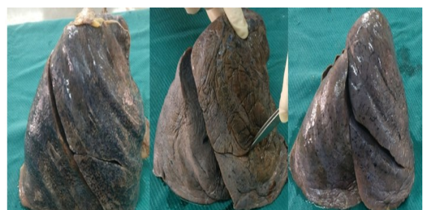
Fig. 1: Right lungs showing incomplete horizontal fissure.

The anatomical classification proposed by Craig and Walker was followed to classify and determine the presence and completeness of fissures.