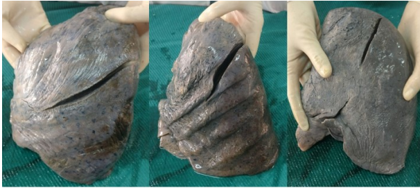
Fig. 3: Left lungs showing accessory fissure.