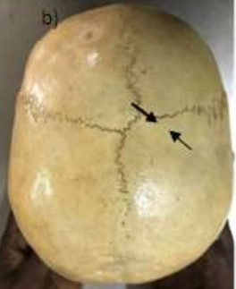
Fig. 2: Partial Metopic suture in the lower part of Frontal bone (just above Nasion) a) linear,b) U-shaped, c)V-shaped d) Y- shaped