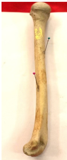
Fig. 1: A photograph of humerus shows double nutrient foramina.