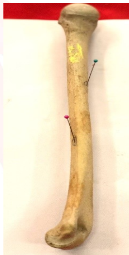
Fig. 2: A photograph of humerus shows triple nutrient foramina.