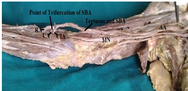
Table 4: Comparison of Incidence of Trifurcation of Superficial Brachial Artery (SBA).