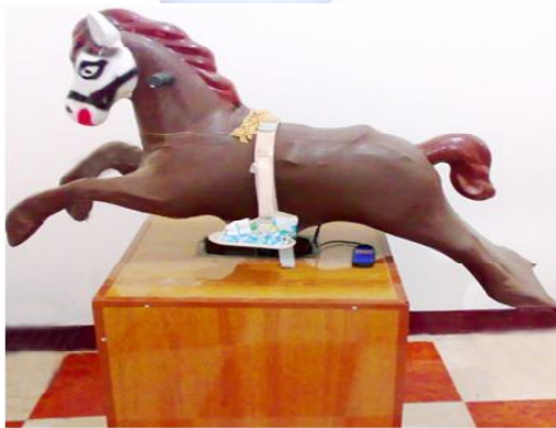
Fig 1: Hippotherapy simulators.

An electronic horse provides rocking movement in anteroposterior, lateral directions and combination of both directions. The horse was equipped with two three phase motor (code COSQ 0.72), speed 1500 cycle / sec, 1.8 amps. The industrial invertors (code VF-NC1) controls the three phase inductive motors speed and transfer electricity to direct current.